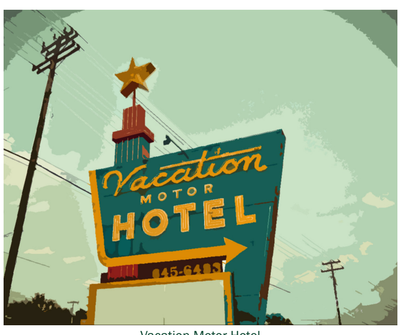
Vacation Motor Hotel

Although short-term rentals are currently prohibited, the prohibitions are largely unenforced. The Los Angeles Department of Building and Safety (LADBS) is charged with enforcing the ordinances which ban short-term vacation rentals. Typically, unless a complaint is filed with LADBS, no enforcement action is taken. Difficulties